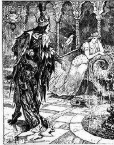
The Wizard King pays a visit to the Princess Image: Henry Justice Ford 1894

Benarrawa: 79 Waratah Avenue, Graceville on Monday 17 th October 9:30-11.45am